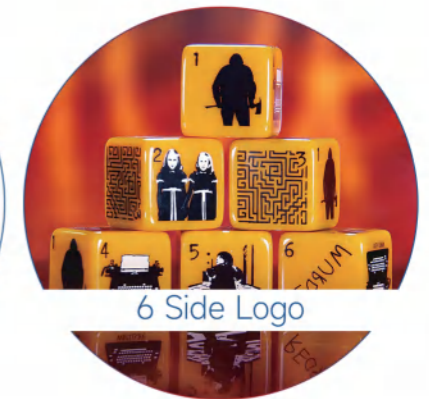
6 Side Logo