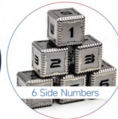
6 Side Numbers