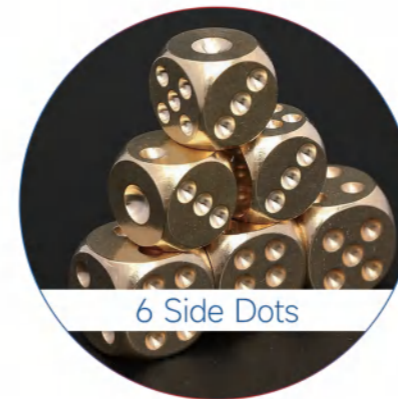
6 Side Dots

The scorpion has six side of the Dice; the 6 side Dice style includes: 6 sided dots, 6 side numbers, 6 Side logo; Polyhedral Dices include: D4, D6, D8, D10, D10 percent, D12, D20, Uncommon dice are: D24, D30, D60, D100, etc.